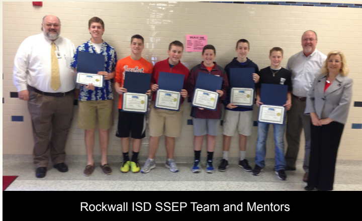
Rockwall ISD SSEP Team and Mentors

This on-orbit educational research opportunity is enabled through NanoRacks, LLC, which provides additional funding and works in partnership with NASA under a Space Act Agreement as part of the utilization of the International Space Station as a National Laboratory. Below are links to the district website and to the NCESSSE website if you would like more information about the SSEP program.