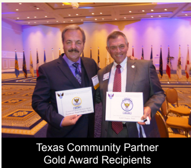
Texas Community Partner Gold Award Recipients

These briefings included the AFA Strategic Plan, Aerospace Education, the Wounded Airman Program Field Guidebook, Member Retention, methods of reaching out to Young Professionals, interface with Congressional representatives, Transition Programs to place retiring Airmen into private industry jobs, along with the latest AFA training modules.