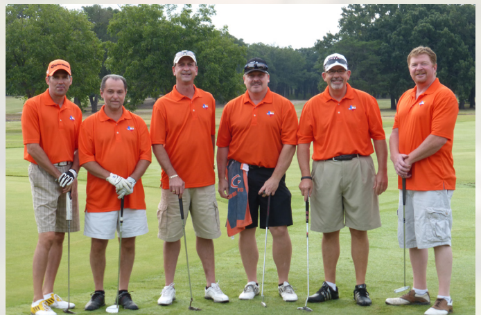
Golf Thing Team!