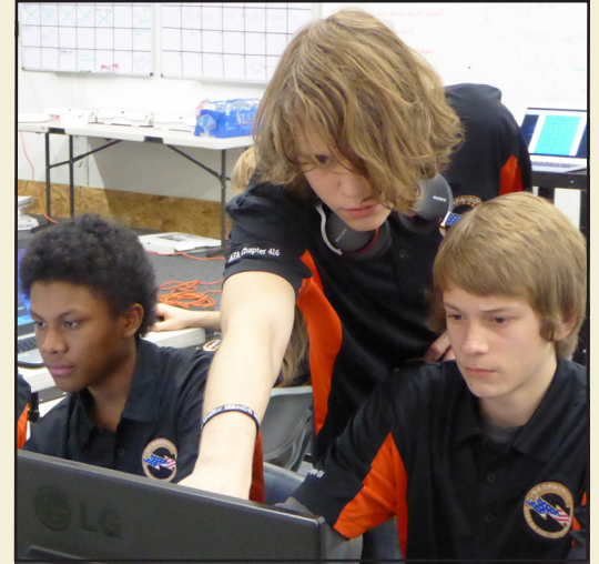
Chapter 416, along with Community Partner Checkmate Embroidery, provided competition shirts to the competing CyberPatriot teams for this years competition. The students did really well and competed all the way to regional's where they were knocked out of the final round of competition. We are proud of our teams and know that what they have learned will carry with them for years to come!