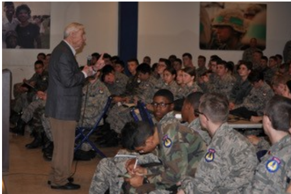
CMSAF Bob Gaylor speaking to CAP Cadets

Chapter 416 leadership was responsible for providing the keynote speakers in most of these areas. By linking these young men and women with some of the most notable former military members in Texas, they were able to learn from the "best of the best".