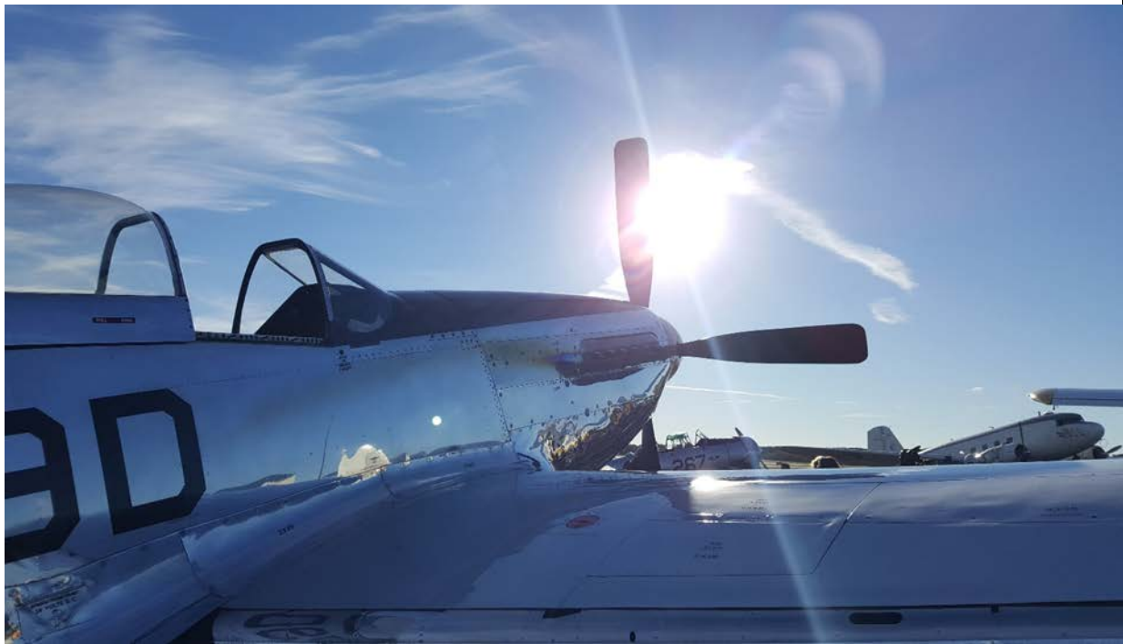
Last year the Sulphur Springs Civil Air Patrol (CAP) Squadron aided in spearheading a “Fly In” at the Greenville, TX, airfield. The event featured numerous aircraft on display, this photo being one of them.