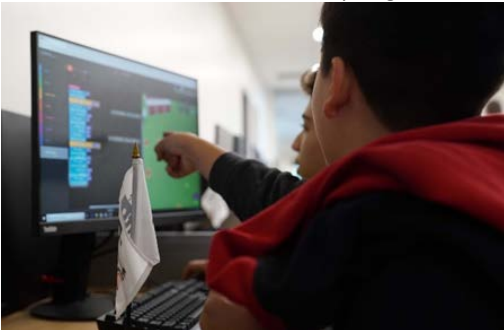
Coding participants making it happen!