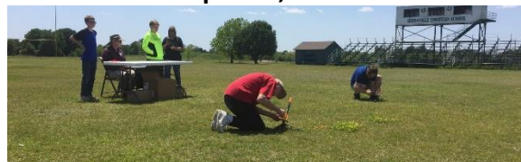
Readying the rockets for launch!