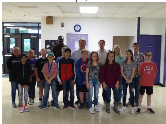
Farmersville Jr. High Students who participated in the Science Fair. What a great showing and time. Thank you! (above and below)