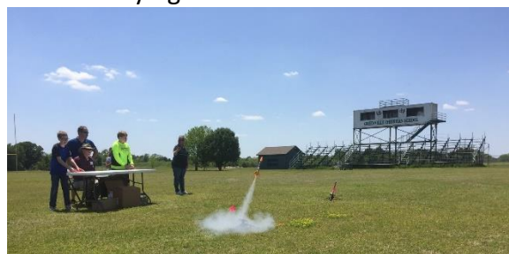
Liftoff Into the wild blue yonder!